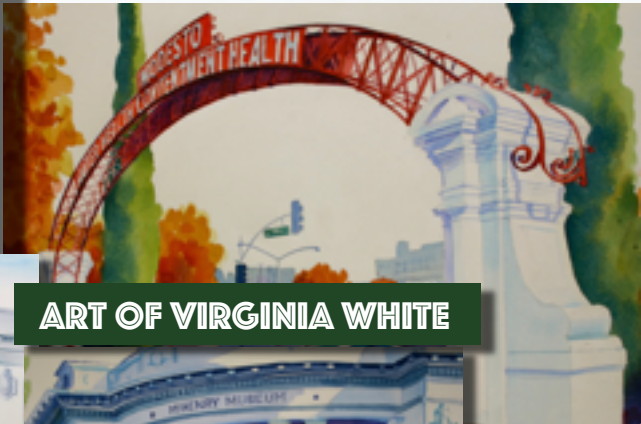
ART OF VIRGINIA WHITE