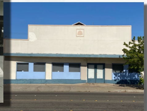
Jewett Motors Building today 1410 9th Street