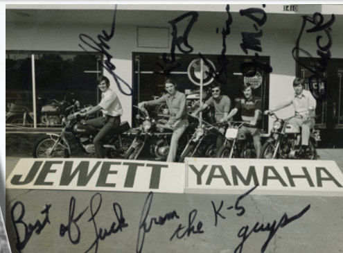
KFIV at Jewett Motors