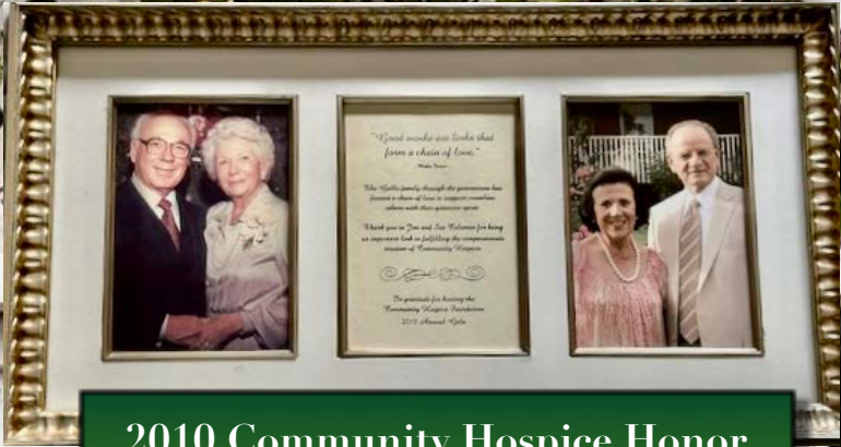
2010 Community Hospice Honor