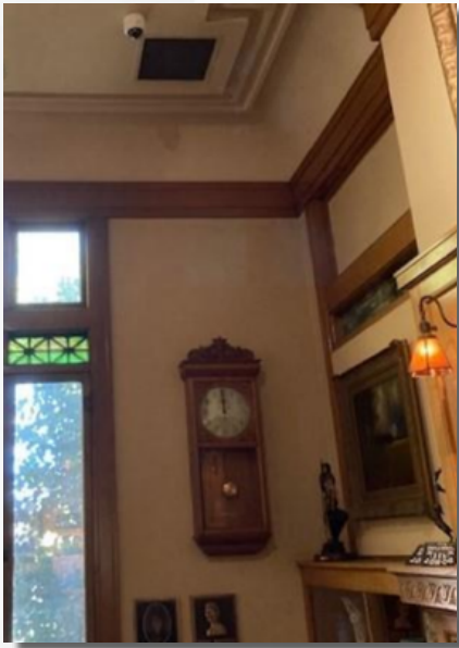
New Security Cameras