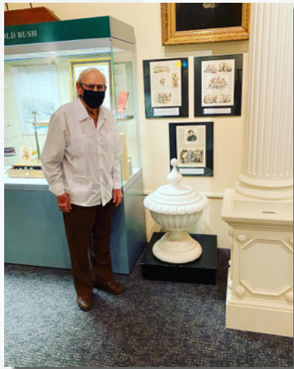
August 8, 2021 with the Finial.