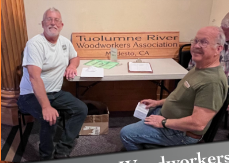
Tuolumne River Woodworkers